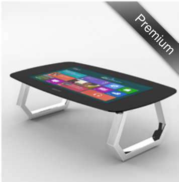
M246S-BC Black on Chrome