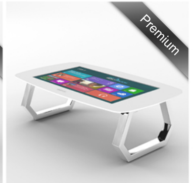
M246S-WC White on Chrome